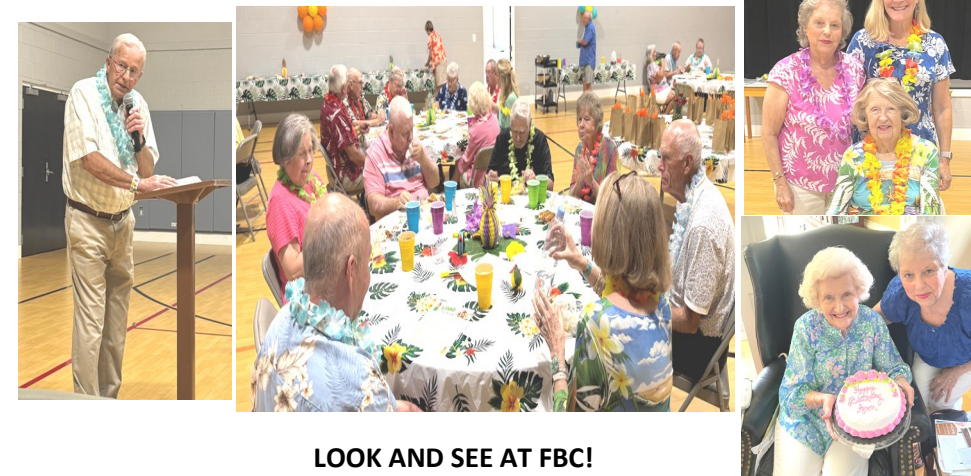
LOOK AND SEE AT FBC!