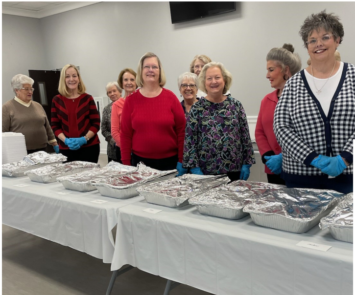
Some of the volunteers who helped with the East Regional Baptists On Mission Rally.