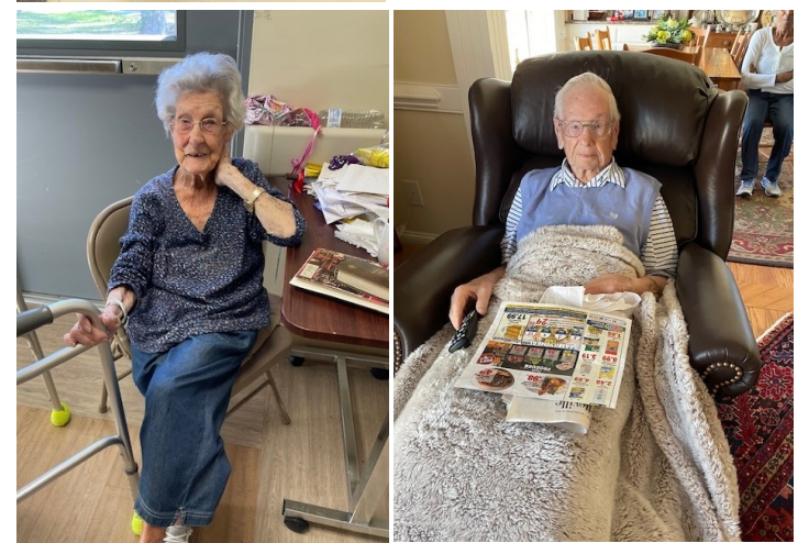
Seniors traveled to see the Rudy Theater Easter Show on March 18.