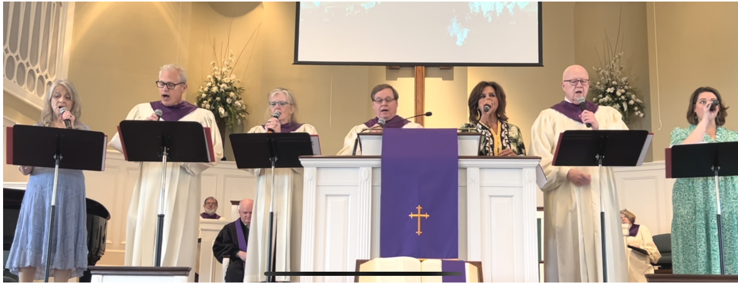
LIFTED sang during the worship service on March 17.